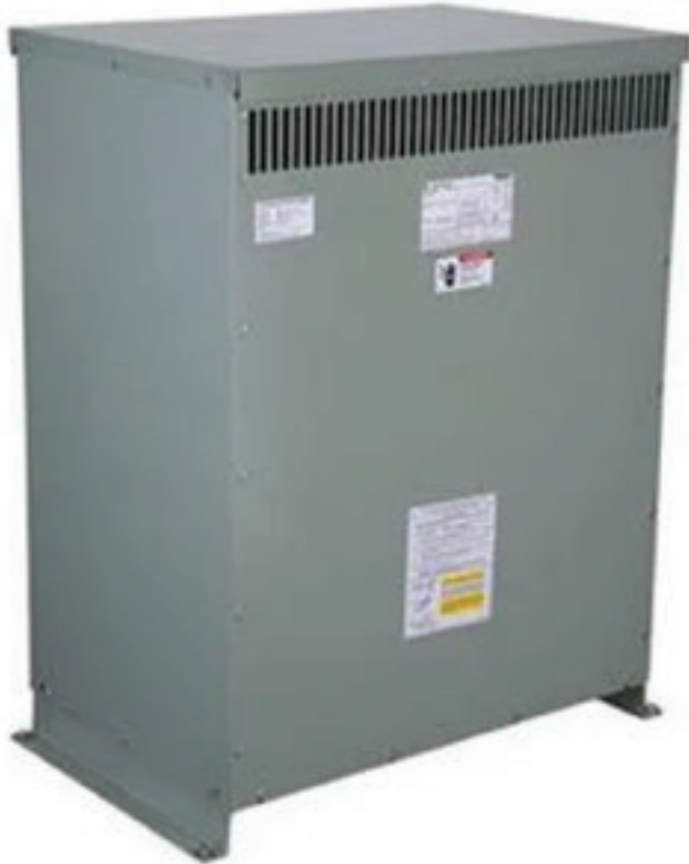
ABB GE Industrial 9T10A1002 General Purpose Transformer; 3 Phase, 480 Volt Primary, 208 Volt Y/120 Volt Secondary, 30 KVA #103976

ABB GE Industrial 9T10A1003 General Purpose Transformer; 3 Phase, 480 Volt Primary, 208 Volt Y/120 Volt Secondary, 45 KVA #106035