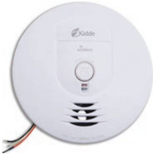
$59.99 ea. Kidde RF-SM-AC AC Hardwired Wireless Interconnect Smoke Alarm #66108