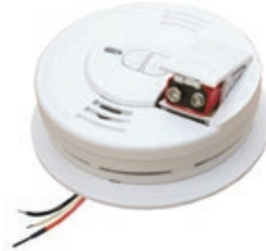
$12.99 ea. Kidde 21006376 AC Hardwired Smoke Alarm #43024